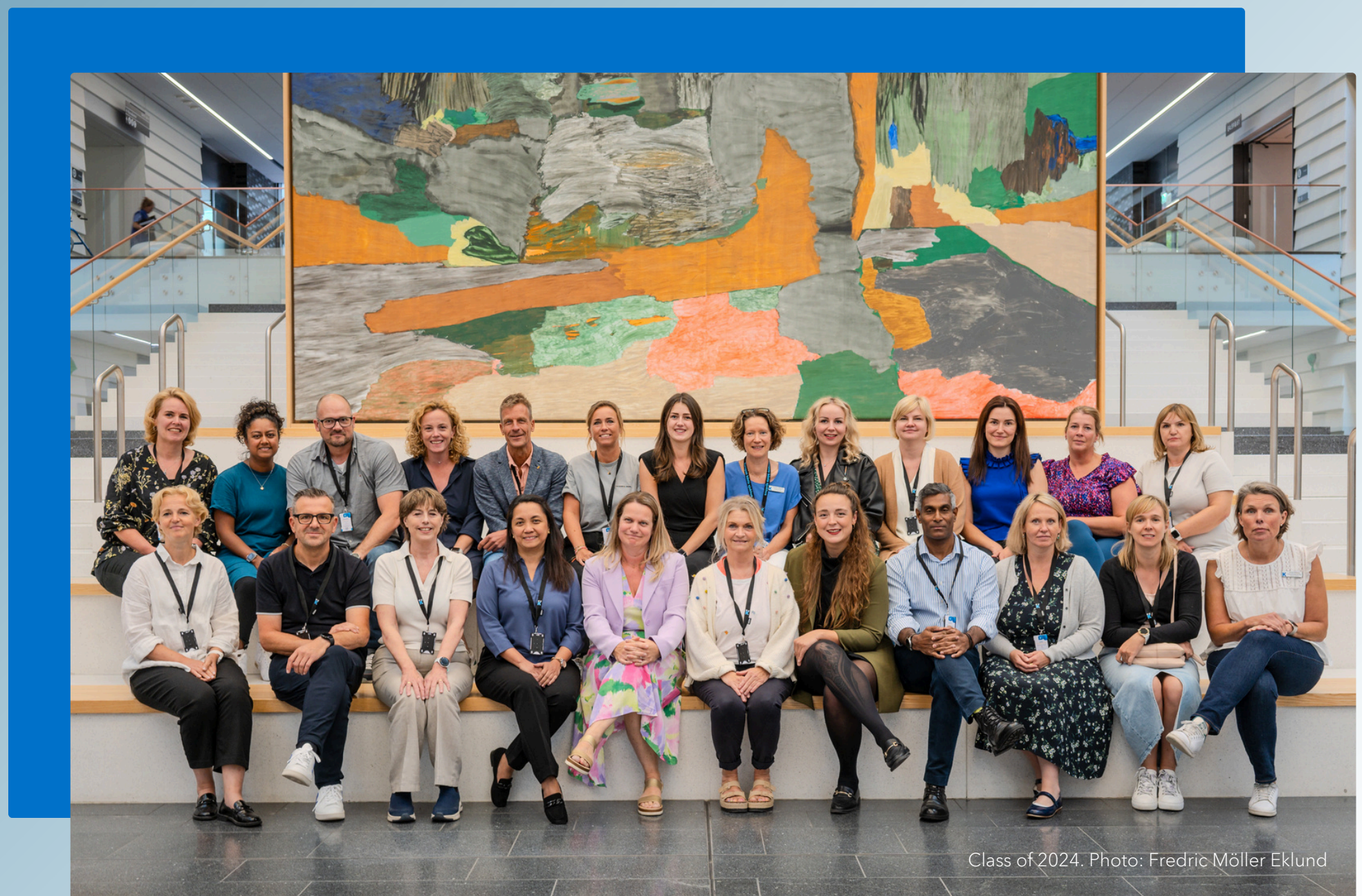
Class of 2024.

The integration of artificial intelligence is also a key element, advancing cancer therapies and improving diagnostics by analyzing vast amounts of patient data quickly and accurately.